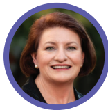
Toni Atkins California State Senator