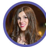
Danica Roem Virginia State Senator