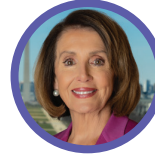
Nancy Pelosi Former Speaker of the U.S. House