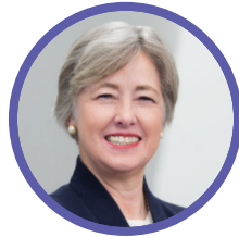
MAYOR ANNISE PARKER PRESIDENT & CEO

“ Our International LGBTQ+ Leaders Conference is a unique three-day experience that brings together more than 600 LGBTQ+ elected officials and leaders from across the United States and world. U.S. senators, state legislators, city councilmembers and other leaders join our corporate partners in strategizing how to move forward equality legislation and other public policies that affect all our communities. The networking, skills-building and policy conversations these LGBTQ+ leaders participate in have a profound effect on where our movement directs its energy next – and that is why our partners find the conference so invaluable.