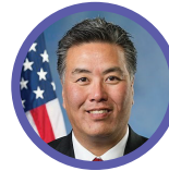
Mark Takano U.S. Representative (CA-41)