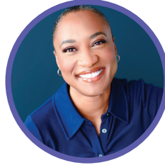
Laphonza Butler U.S. Senator (CA)