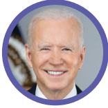
Joe Biden U.S. President