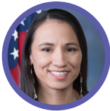
Sharice Davids U.S. Representative (KS-3)