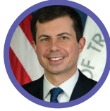
Pete Buttigieg U.S. Secretary of Transportation