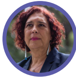
Tamara Adrián Venezuelan Assemblywoman