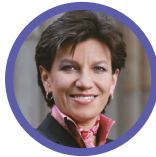
Claudia López Hernández Mayor of Bogota, Colombia