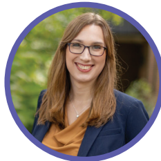
Sarah McBride Delaware State Senator