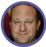
Jared Polis Governor of Colorado