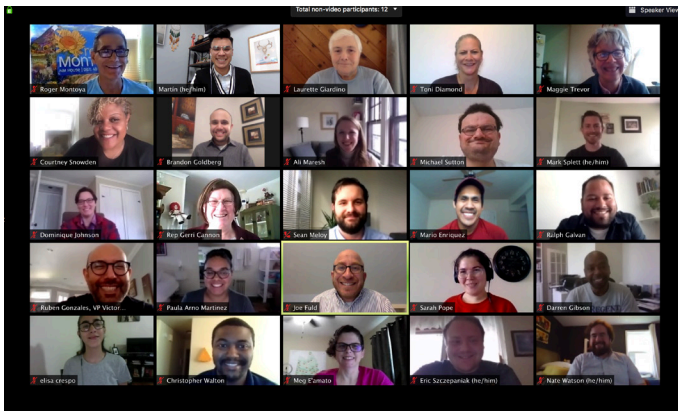
Participants at a virtual Candidate & Campaign Training.

We trained 111 LGBTQ candidates and future candidates to run for office in 2020—first at our in-person four-day Phoenix training in February and then in two three-day virtual trainings.