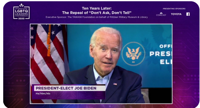
President Joe Biden speaks at the International LGBTQ Leaders Conference.