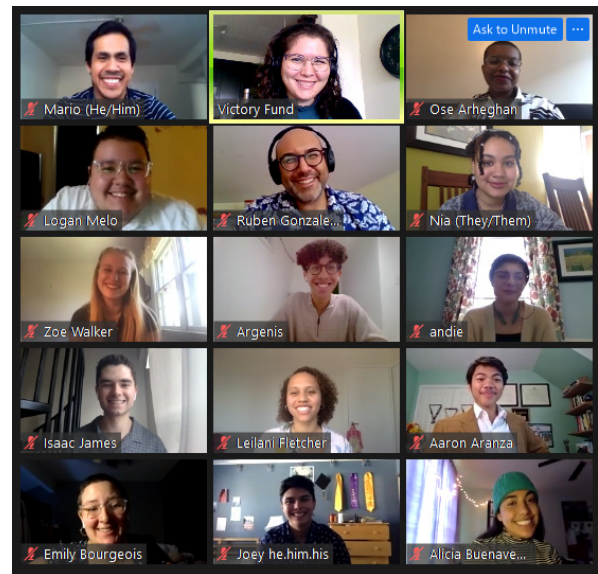
The Summer 2020 cohort of Victory Congressional Interns.