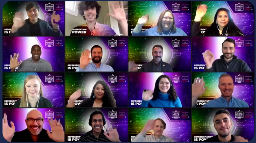
Staff waves during the virtual 2020 International LGBTQ Leaders Conference.