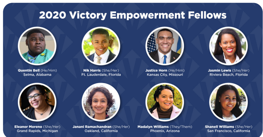
The 2020 class of Victory Empowerment Fellows.

Eight LGBTQ leaders made up the 2020 class of Victory Empowerment Fellows, with the programming adapted for a remote fellowship. The program—which supports LGBTQ people of color and/or trans people seeking a career in public service—includes participation in our Candidate & Campaign Training and a year-long mentorship program. The fellowship also provides monthly programming with elected officials, political experts and endorsement organizations.