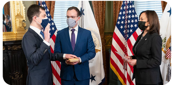
Pete Buttigieg with husband Chasten being sworn-in after his confirmation.

We are also working with President Biden’s team to ensure LGBTQ people are equitably represented among presidential appointees at every level and that they reflect the full diversity of the LGBTQ community.