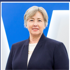
Mayor Annise Parker

Stonewall was the spark, but now we are responsible for ensuring our enormous progress continues apace. Thanks for supporting our work here in the United States and around the world. We could not do it without you.