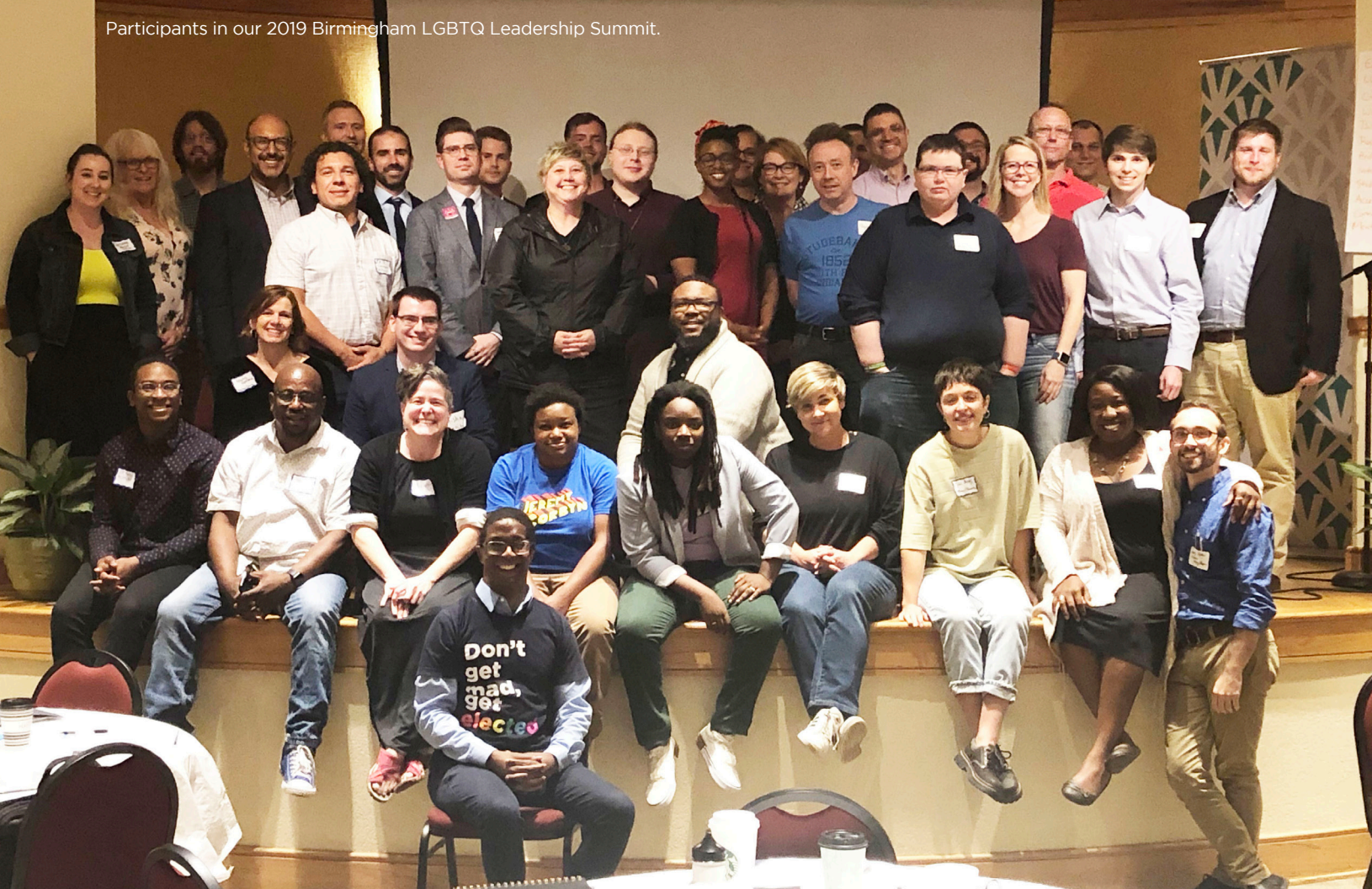
Participants in our 2019 Birmingham LGBTQ Leadership Summit.

Our full-day LGBTQ Leadership Summits are held in states with few openly LGBTQ elected officials or low levels of equality, with an eye toward increasing LGBTQ representation in the state. Working with local partner organizations and elected officials, Victory Institute encourages participants to consider a run and provides a primer on how to get started. The 2019 LGBTQ Leadership Summits were held in Orlando (FL), Birmingham (AL), Missoula (MT) and Omaha (NE).