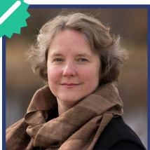
Satya Rhodes-Conway Mayor of Madison (WI)