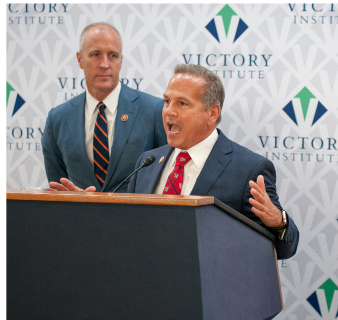
U.S. Rep. David Cicilline speaks with U.S. Rep. Sean Patrick Maloney in the background at the 2019 Congressional Pride Reception on Capitol Hill.