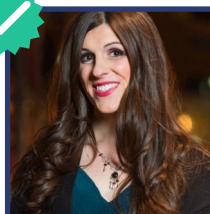
Danica Roem Virginia House of Delegates