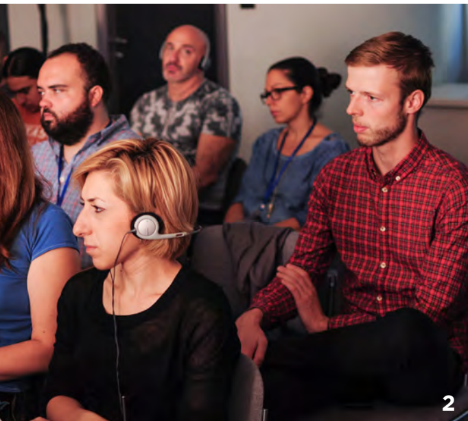
(1) Lesbian political leadership panel at the regional conference in the Balkans (September 2015). (2) Participants at the 'Democracy for All' regional conference in the Balkans (September 2015).