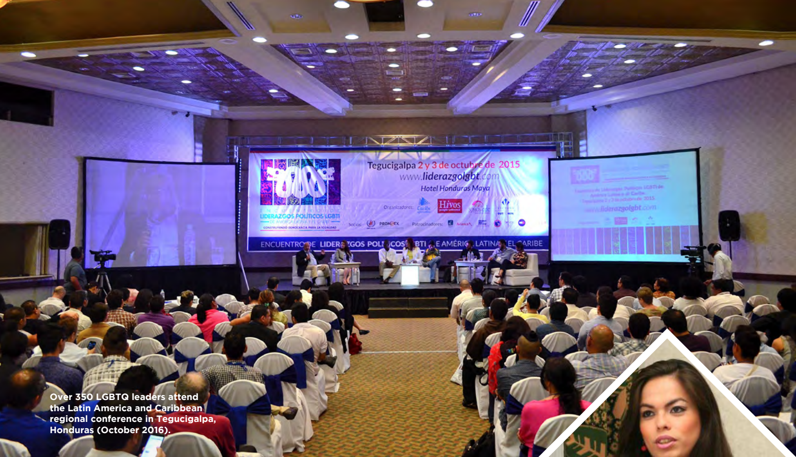
Over 350 LGBTQ leaders attend the Latin America and Caribbean regional conference in Tegucigalpa, Honduras (October 2016).