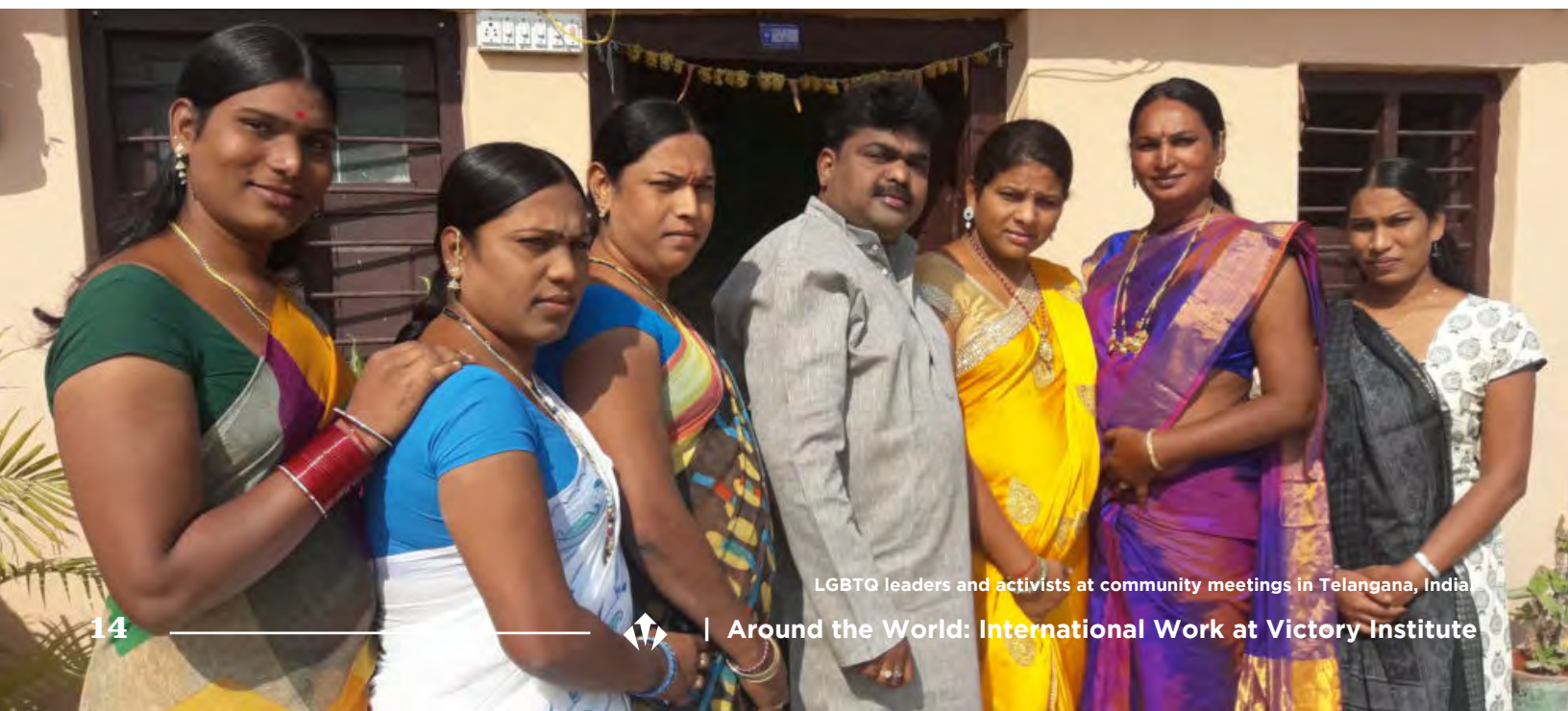
LGBTQ leaders and activists at community meetings in Telangana, India