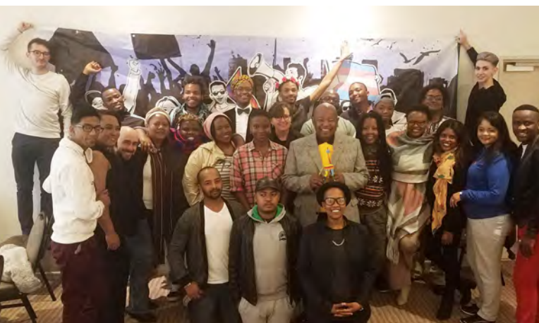
Mosiuoa Lekota, leader of the political party Congress of the People (COPE), meets training participants.