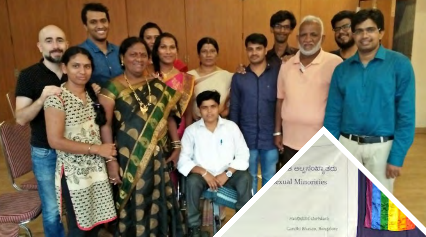
Participants of the LGBTQ Political Leadership Academy in India.