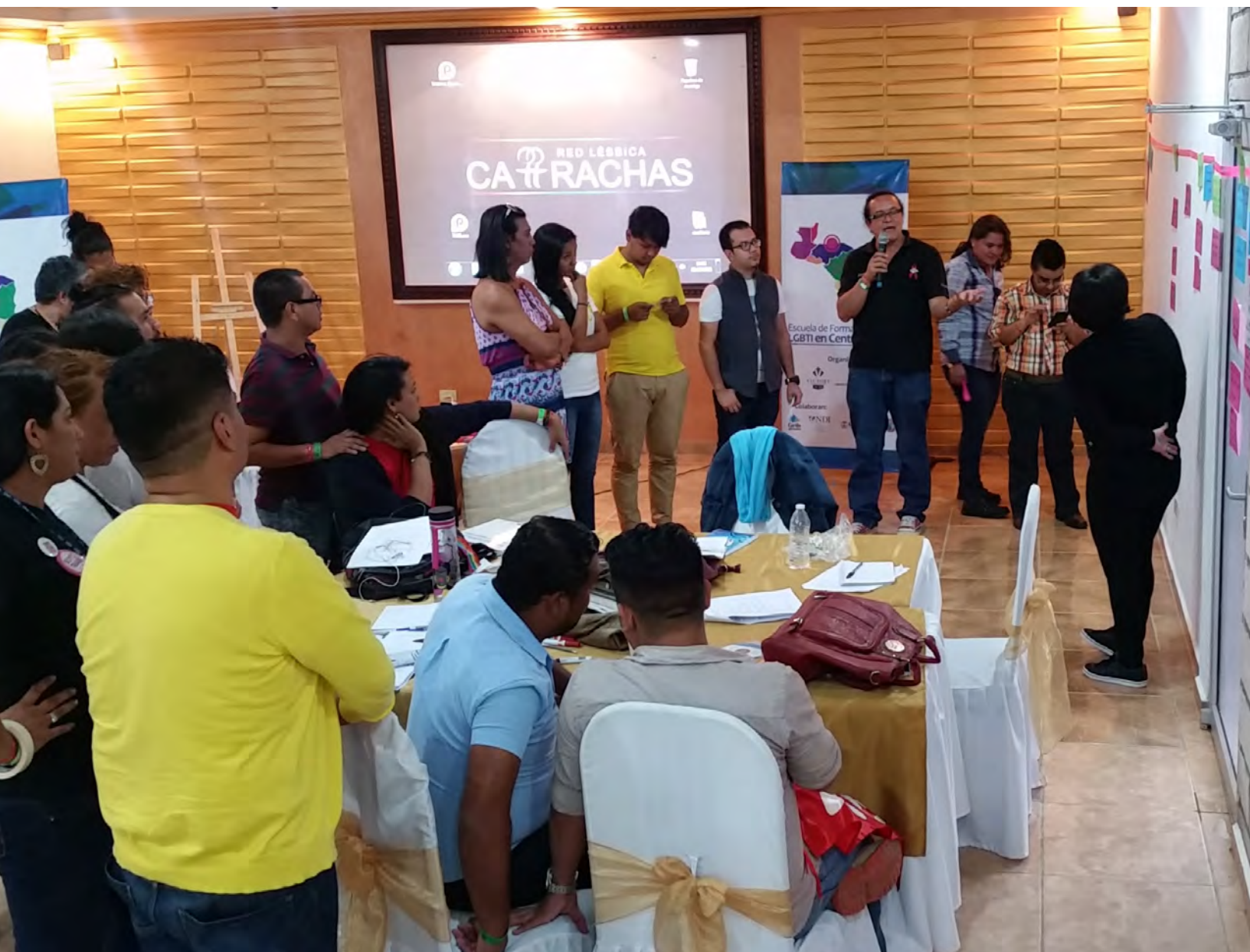
LGBTQ leaders from all over Central America attend the LGBTQ Political Leadership Academy in Honduras.

Victory Institute also provides fellowships and internships on Capitol Hill for LGBTQ young people seeking careers in policy or politics, and a fellowship for LGBTQ people of color and transgender leaders interested in running for office.