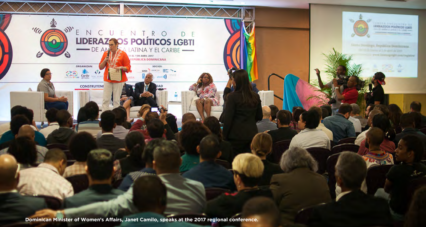
Dominican Minister of Women's Affairs, Janet Camilo, speaks at the 2017 regional conference.