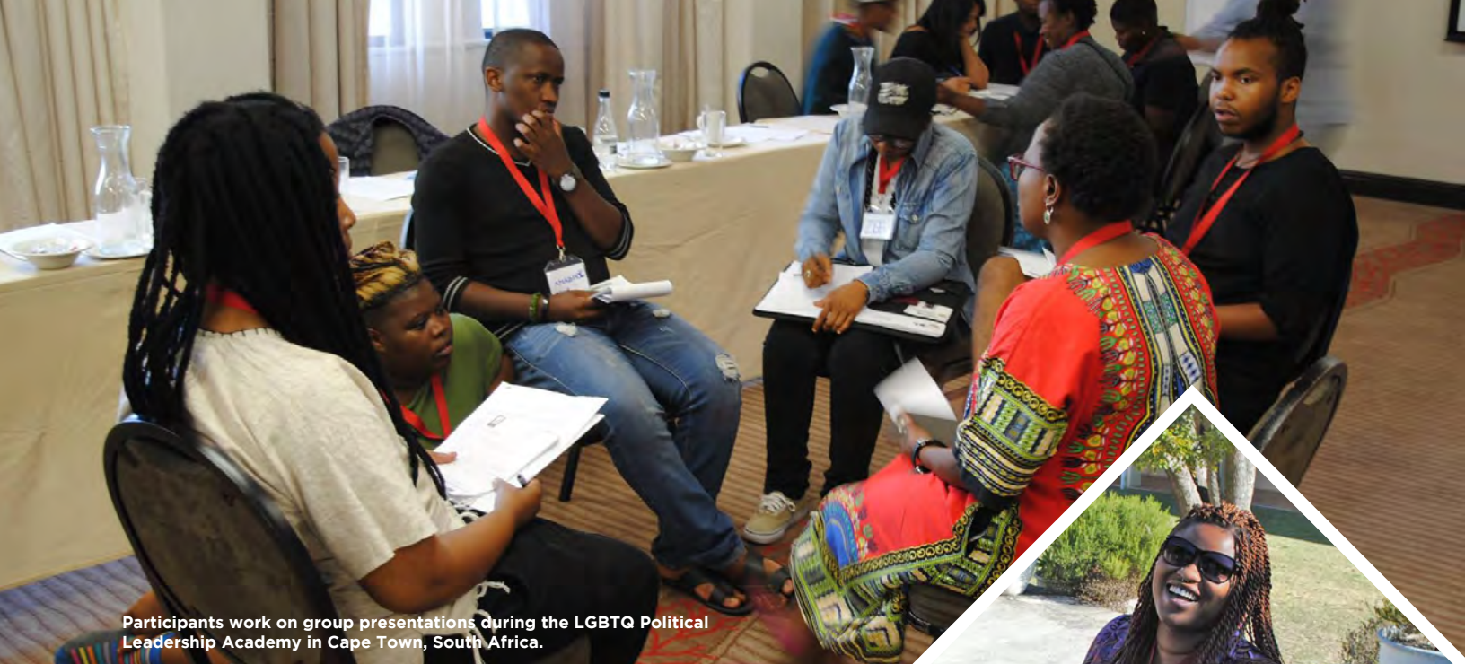
Participants work on group presentations during the LGBTQ Political Leadership Academy in Cape Town, South Africa.