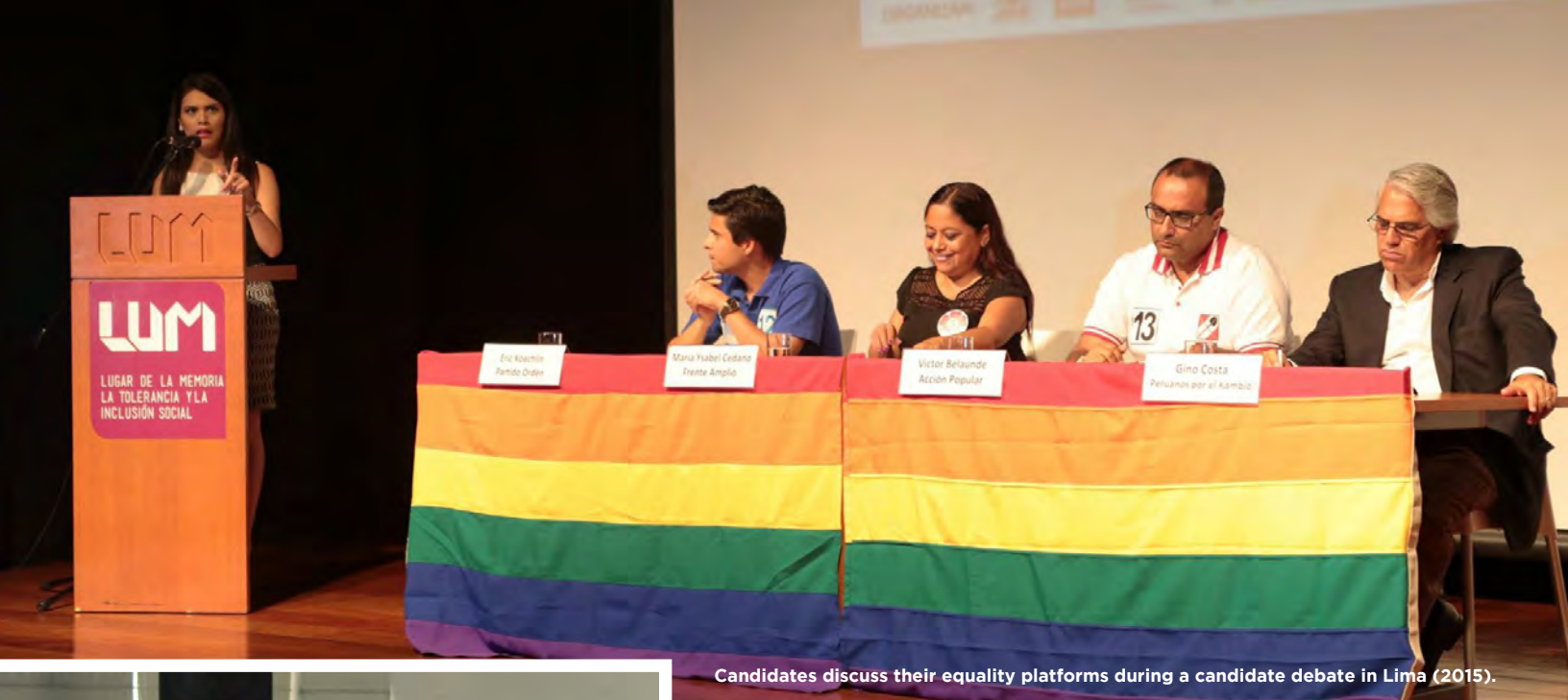
Candidates discuss their equality platforms during a candidate debate in Lima (2015).