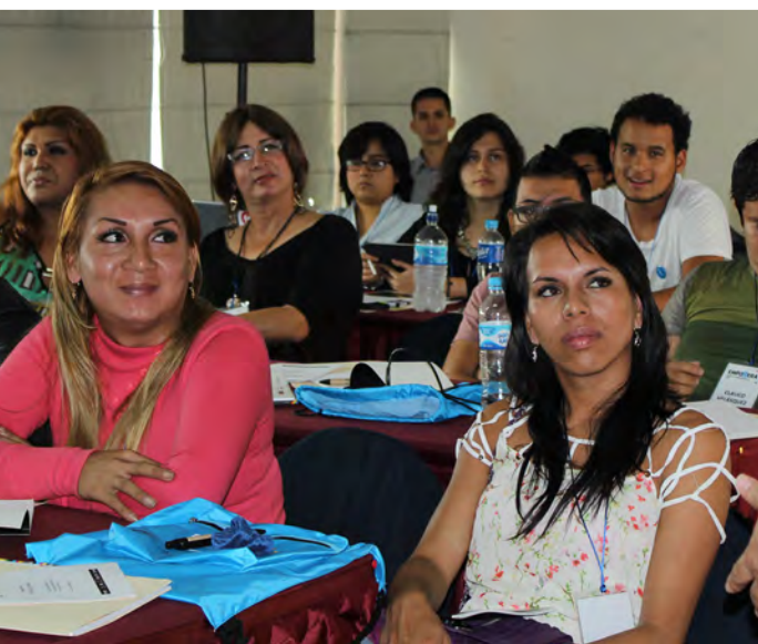
Participants listen attentively at the LGBTQ Political Leadership Academy in Lima (2014).