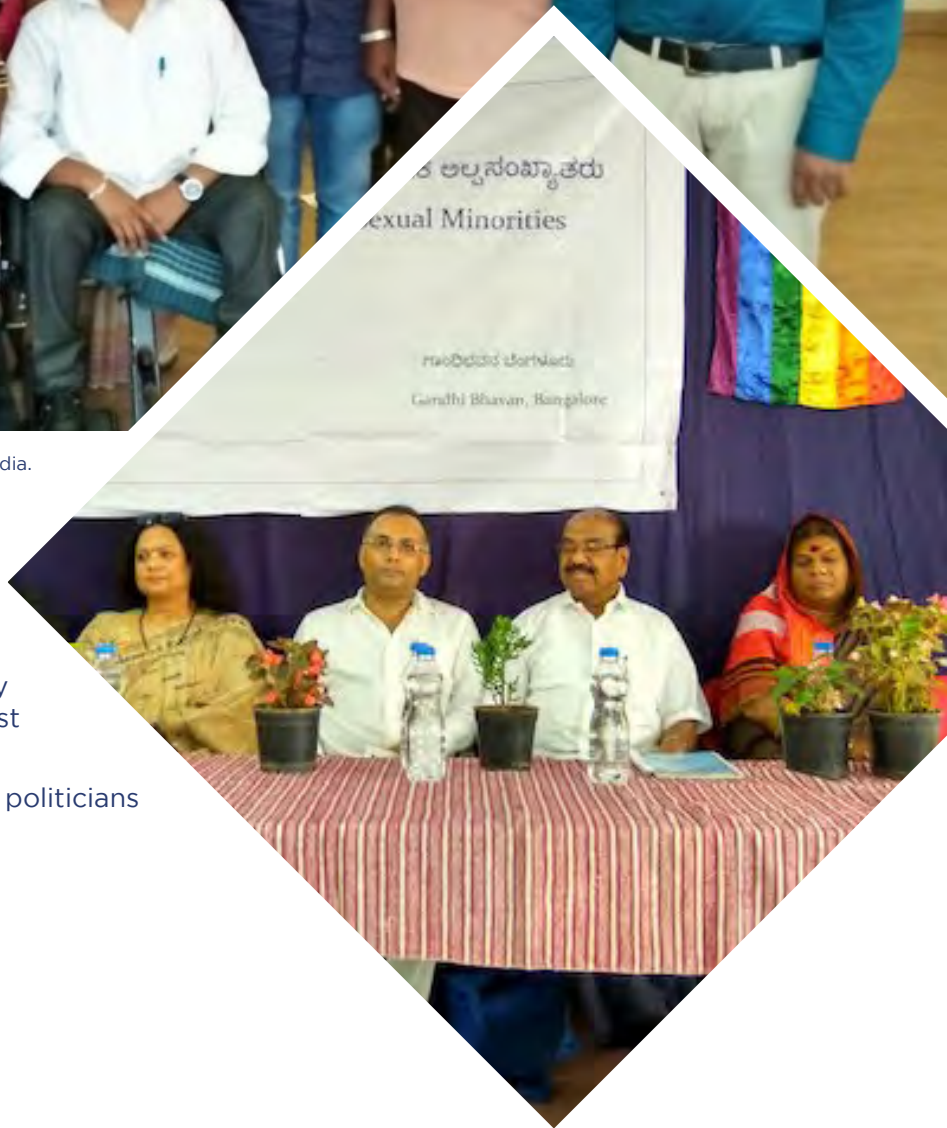
Trainees organize a civil society forum with activists and political party representatives in Bangalore (2017).